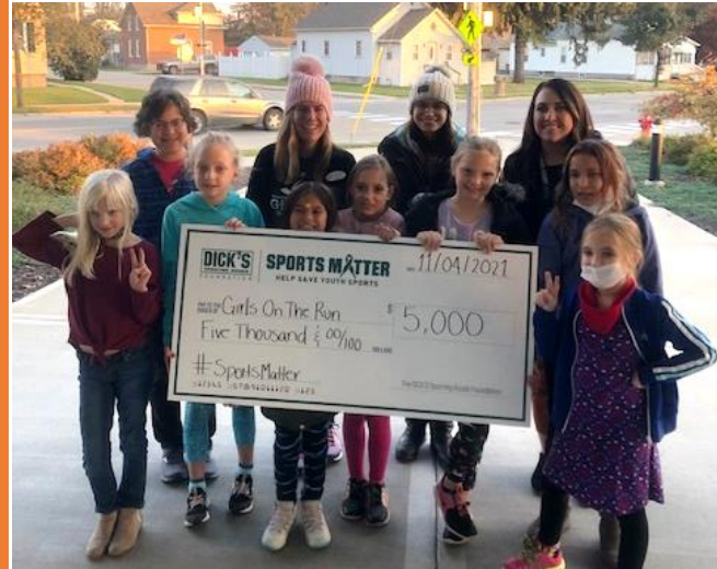
DICK's Sporting Goods Foundation Grant Check Presentation at the Boys and Girls Club of the Fox Valley, Menasha location.