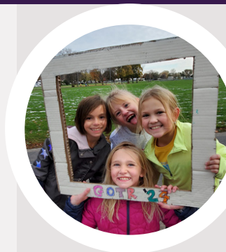
Fall 2023 Girls on the Run Participants after their Practice 5k

Appleton Area School District Boys & Girls Club-Green Bay De Pere School District Freedom School District Grace Catholic Schools Green Bay School District Greenville School District Hortonville School District Kaukauna School District Kiel School District Kimberly School District Kohler School District Little Chute School District Menasha School District Neenah Joint School District New Holstein School District Oostburg School District Oshkosh School District Sheboygan School District St. Mary Catholic Schools Weyauwega-Fremont Schools Winneconne School District