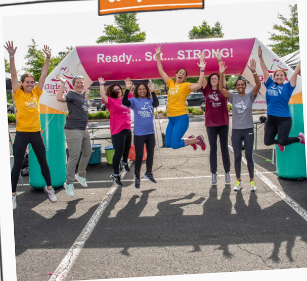
GOTR NOVA TEAM