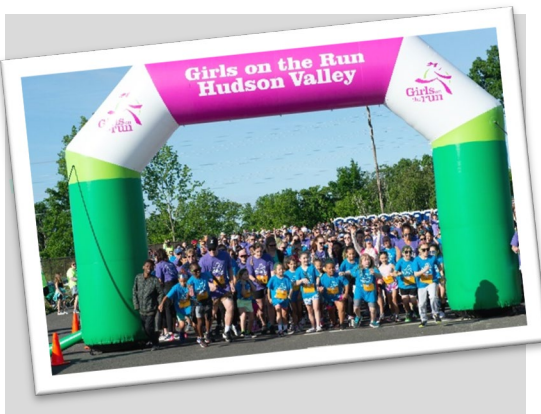
Start / Finish Line Arch