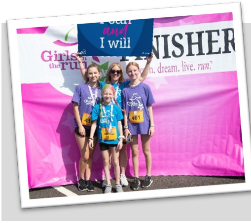
Step & Repeat