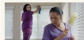
WHEN YOU CLEAN A STRANGER'S HOME (7:00)

Frustrated with the lack of character diversity in The New Yorker's cartoons, an artist submits her own illustrations, becoming the first Black woman cartoonist in the magazine's near-century run. Filmmaker: Abi Cole (Weaverville, NC)