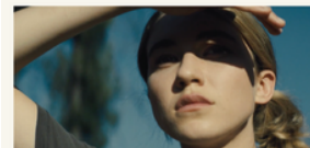
PROOF OF LOSS (14:00)