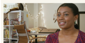
BETWEEN THE LINES: LIZ AT LARGE (5:00)